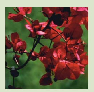
Relief Colds, Flu &Virus

Energy Spirit - For a real burst of energy add one drop to a bottle of water, shake well and sip throughout the day. One drop can be used to sterilize your hands when soap and water are not available. A drop on your toothbrush in the morning will help to fortify your system. The oils in this blend boost the immune system and are very uplifting which can reduce the feelings of depression. Do not use late in the day, it's very energizing!