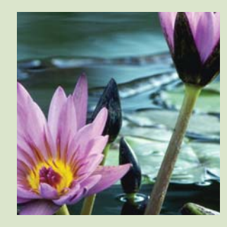
Relief Migraine/ Stress