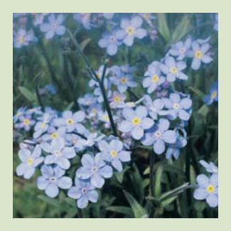
Serenity Sweet Dreams